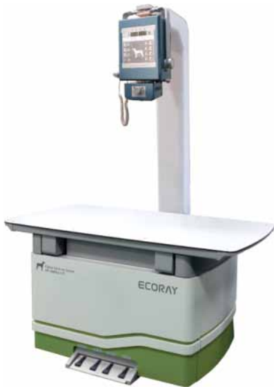
Available for Veterinary with table option