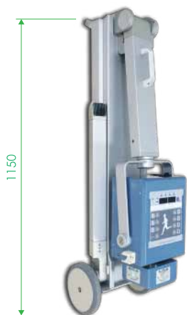
Compact Mobile Stand

Specification is subject to change without prior notice.